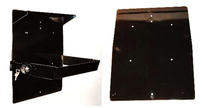
Indoor pedestal mounts for dispensers; can for towels and locking bands are available.

Locking outdoor and standard indoor mounting plates for walls, posts, etc.